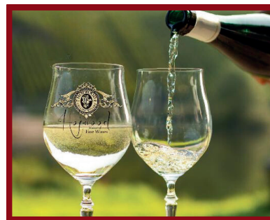
The Cellar will feature 3 wines from Hopwood this year, plus a unique 4th wine that will change each show and be themed to each of our productions.