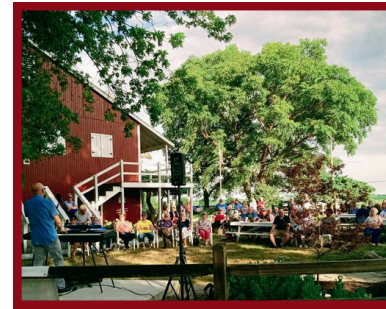
Save the date and come spend a wonderful summer evening on the beautiful grounds of the Red Barn.